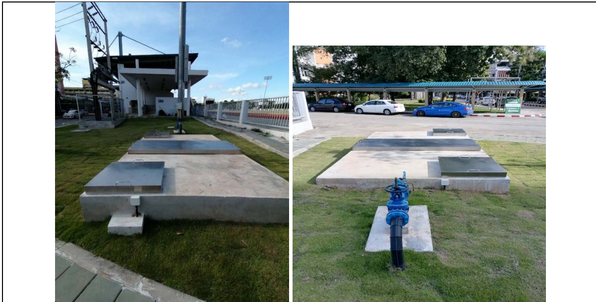
Water storage system at the pool to the water reservoir of NRRU Stadium. Volume 25,000 lite